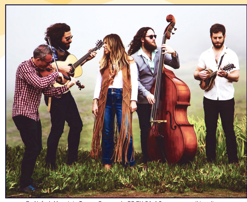
By Nefesh Mountain Team - Own work, CC BY-SA 4.0, commons.wikimedia.org